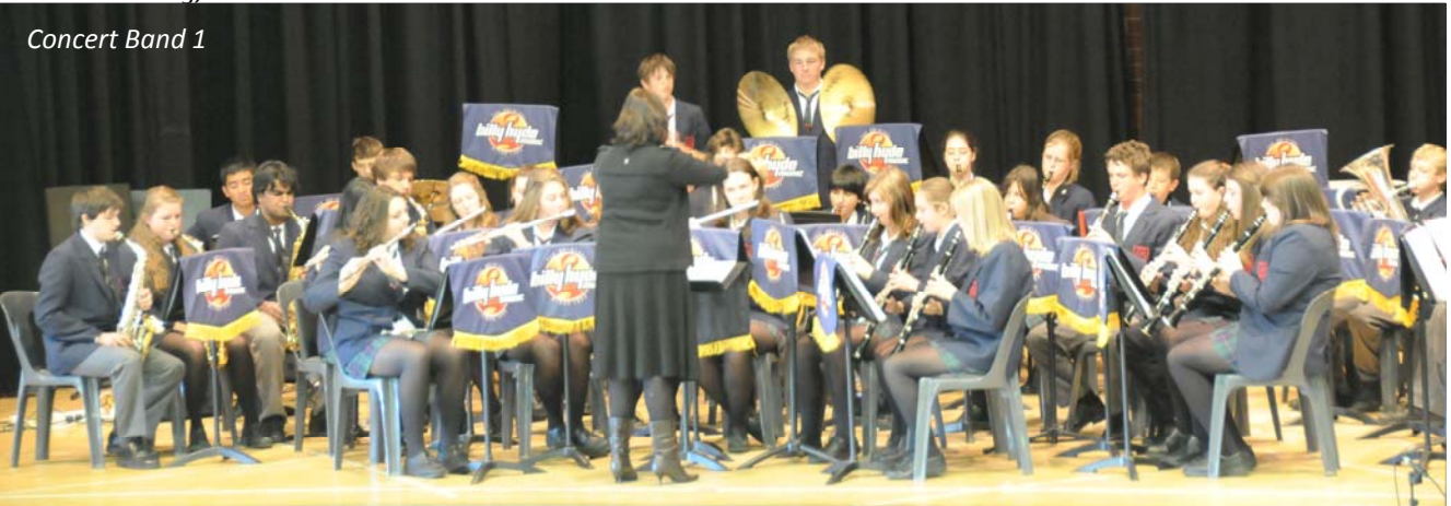
Concert Band 1

Last week our two concert bands again performed at the Northern Beaches Eisteddfod, our 15th time in the past 17 years! There has never been a year when we were not placed, indeed more often than not taking out the winning position. So we had a lot to live up to and prove to ourselves. I am delighted to report that both bands produced fabulous music and looked impressive. The adjudicator ruled that on this occasion he preferred the outstanding work that Concert Band 2 presented, awarding them an impressive 92 marks. Concert Band 1 was awarded a distinguished second place.