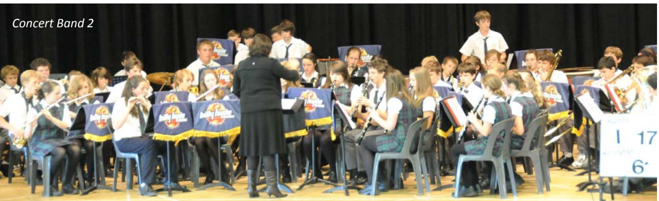
Concert Band 2

It is extremely rewarding to me to see and hear the students taking their performance work seriously while still displaying such unified energy and sense of fun. Well done to all the students.