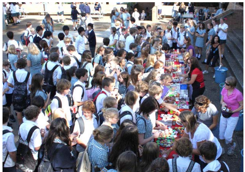
Above: Students enjoying a SOPA BBQ and cake stall fundraiser